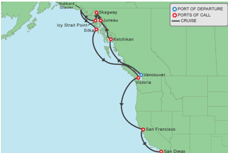
Order of ports of call on map varies from revised 2010 itinerary

Limited Staterooms available – book early to guarantee your cabin.